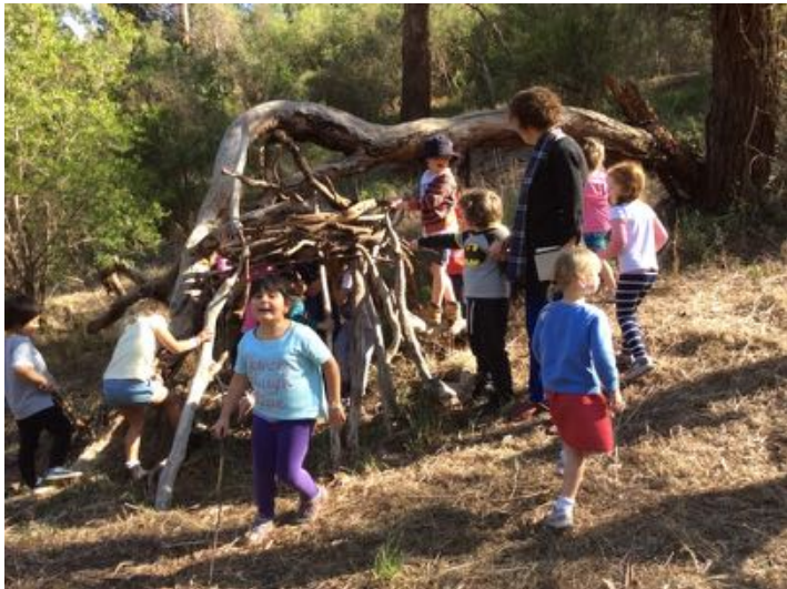
Reserve visit – Growling Grass Frogs

The Swift Parrots had their first venture out into the reserve last week with 5 parents along for the walk. We explored the path that runs behind our kinder all the way to the scout hall. We encountered lots of moss, holes, mushrooms and the chickens next door.