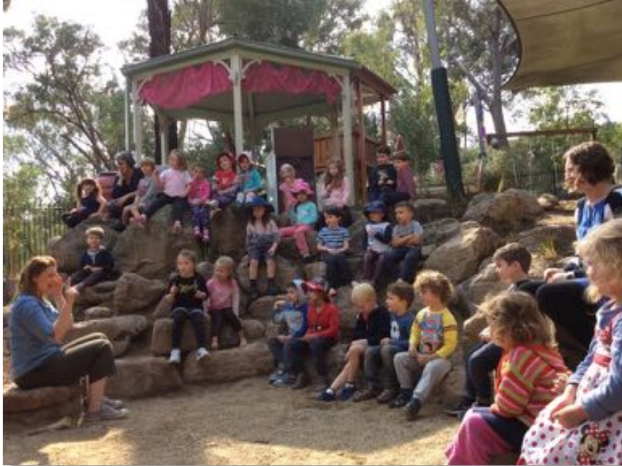
We sing songs in the new amphitheatre