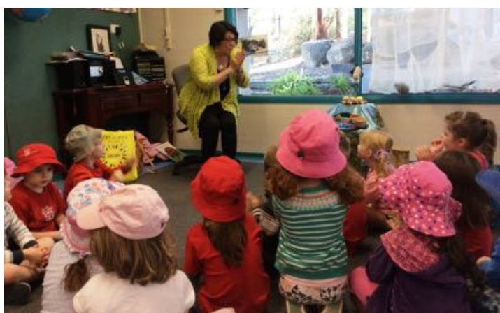
Doris – Growling Grass Frog