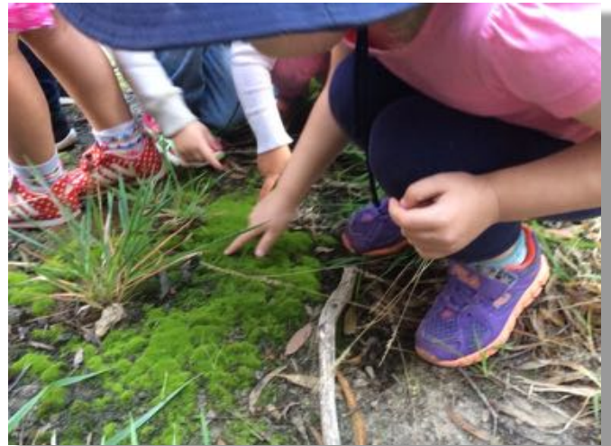
Reserve visit – Swift Parrots

The Growling Grass Frogs in the Monday group went into the reserve as well, but went down to the large open space. Our experienced reserve visitors from last year explained the rules to the new kinder children and then off we went. There was hide and seek, balancing on large fallen tree trunks, running and exploring. We will be continuing to offer this to all our children and would love to have family members come along whenever they can.