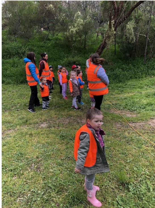
Lining up for a group running race.

Recently we have been discussing feelings during our kinder session. We shared a book and discussed how it is beneficial to acknowledge how we are feeling. We were pleased to see that the children were able to easily identify common feelings such as happy, sad, scared and also with support some more difficult to name feelings such as anxious, confused, thoughtful and curious. We highlighted how it's always okay to experience the full range of feelings and it is how we express these feelings that is important. Strategies to deal with anger that we discussed include taking some deep breaths, telling a friend or teacher, walking away, finding a quiet area to reflect and calm down.